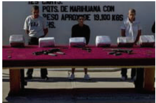
Unidentified alleged gunmen stand next to seized guns and drugs during a presentation to the media .

Mexican President Felipe Calderon, who sent thousands of troops across the country to fight drug gangs, has vowed to clean up prisons that in the past have allowed jailed drug lords to live in luxury or escape when they please.