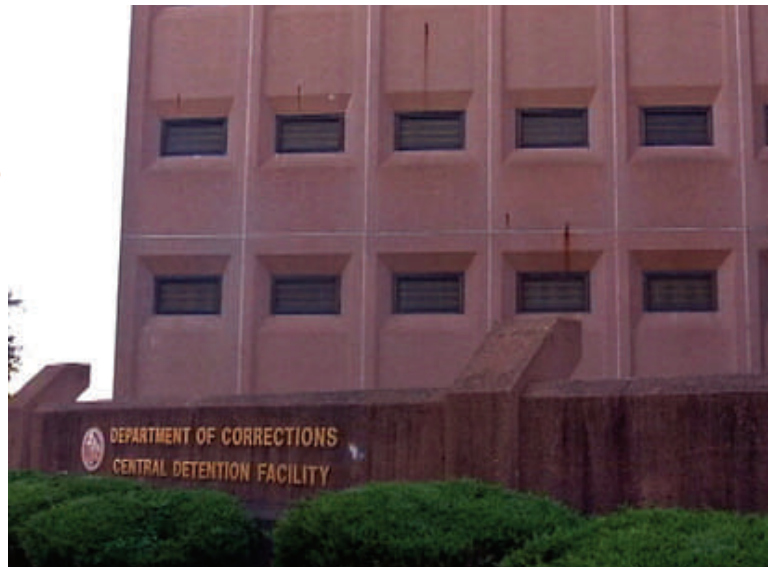
About 1,500 jail inmates will make a difference in D.C.'s mayoral race

Under city law, those jailed for misdemeanors have the right to vote, along with those awaiting trial.